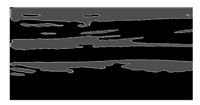
Figure No.3: ROI Detection: Blood (In Black) And The Arterial Tissue (In Gray)